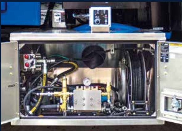
Water System Cabinet