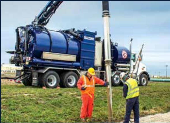
1300 Gallon Tank

The telescoping boom provides robust lifting capacity. The pendant length reaches 55 ft (16.8 m) to give total access around the unit. The boom can be stored with the hose attached for greater convenience between locations and when transporting. An optional extendable boom is available.