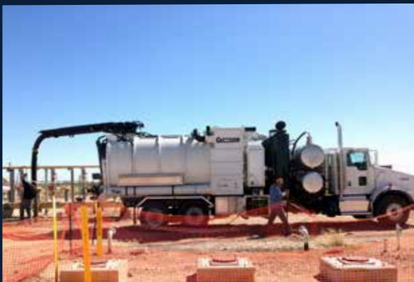
600 Gallon Tank