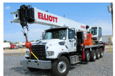
40142R BOOM TRUCK