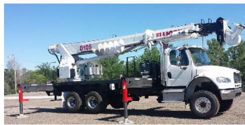
D105R DIGGER DERRICK