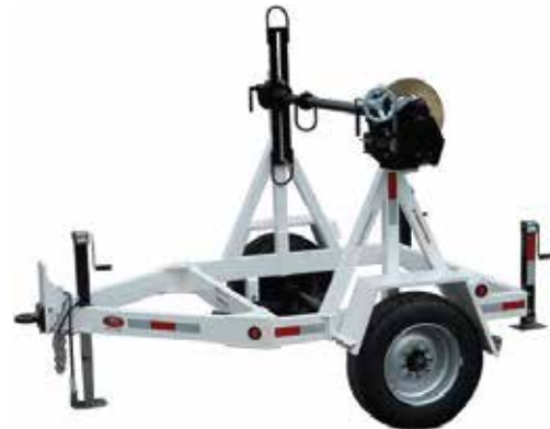
SL POWERLOCK™ STRINGING SERIES