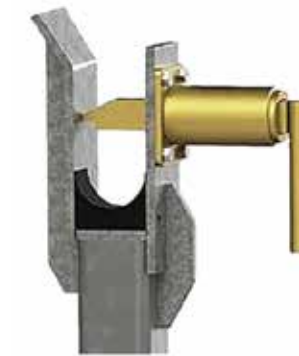
(Non-Encapsulated Top Means Less Drag and Friction)