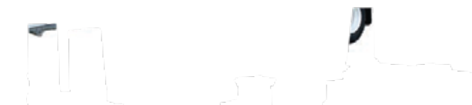
HEAVY DUTY TRANSMISSION W/ REAR EXTENSION