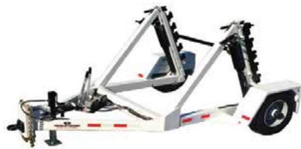
GR DUAL-LOCK™ GENERAL DUTY