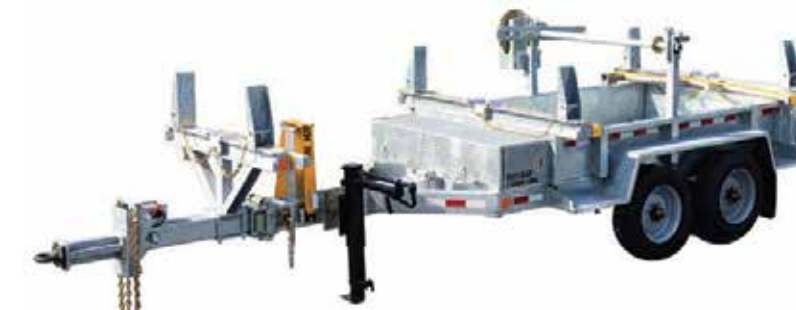
COMBINATION W/ MEGA-ROLLER™

SECURELOCK™ TECHNOLOGY FOR SAFETY, SPEED AND LESS MAINTENANCE