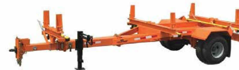
MEDIUM DUTY W/ MEGA-ROLLER™