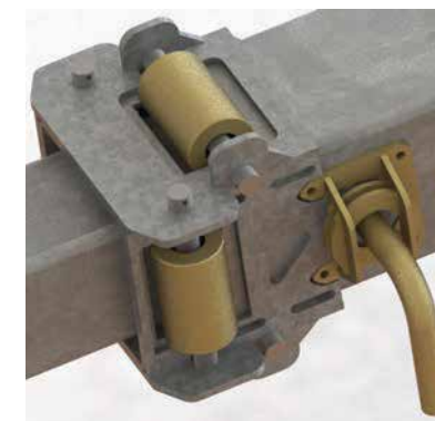
MEGA ROLLER SYSTEM (W/Self-Securing SecureLock™) LIFETIME WARRANTY