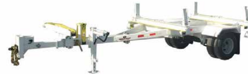
GENERAL DUTY W/ MEGA-ROLLER™