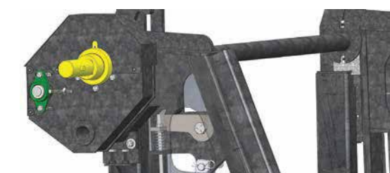
PINLESS AUTOLOCK™ LIFETIME WARRANTY

"THESE DESIGNS ARE TRULY THE BEST I'VE SEEN IN MY 35 YEARS OF FLEET MANAGEMENT. I'VE NEVER SEEN ANYTHING MORE USER FRIENDLY AND FROM A SAFETY PERSPECTIVE I COULDN'T BE MORE CONFIDENT."