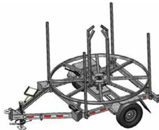
CAROUSEL W/ LIFETIME WARRANTY MAX-ROLLER™ SUPPORTS (self-loading optional)