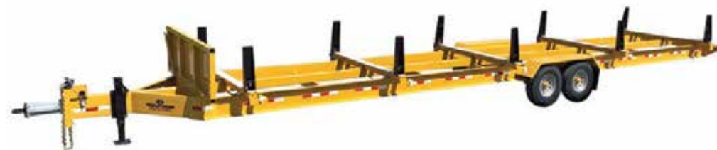
STICK PIPE W/ SECURELOCK™ (UHMW Protected Pipe Seat)