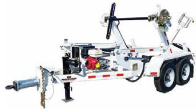
CLD SELF LOADING CARGO W/ POWERLOCK™