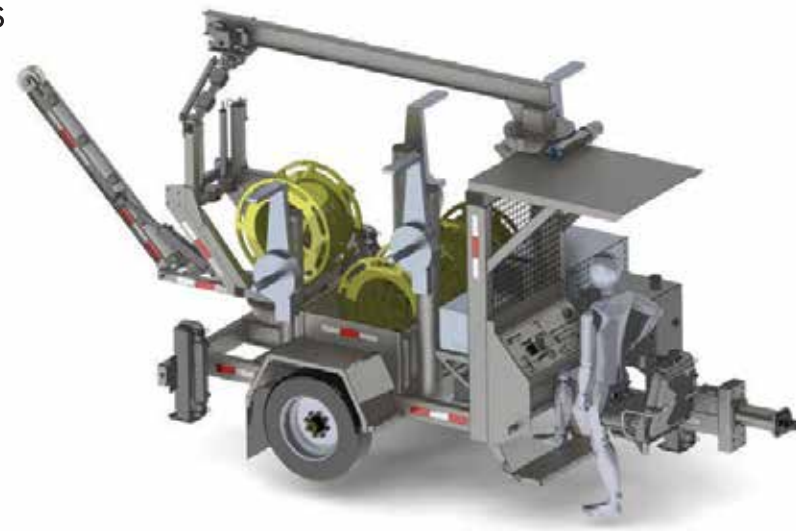
SPU-35 MOBILE OVD/URD UNIVERSAL SPIDER/CAPSTAN PULLER