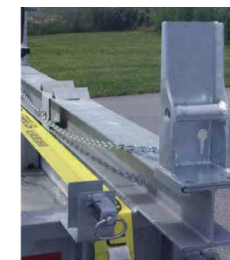
NON-BINDING BASIC STANCHIONS