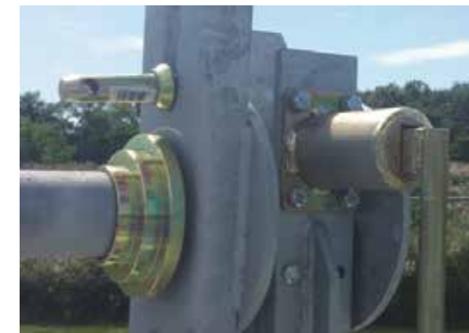
PINLESS POWERLOCK™ REEL BAR LATCH LIFETIME WARRANTY